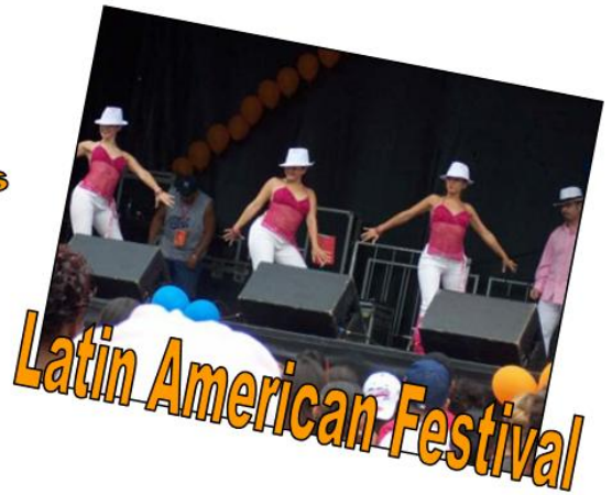
Latin American Festival