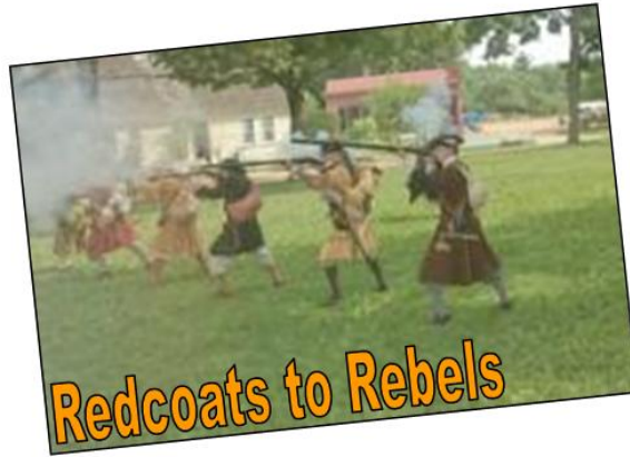
Redcoats to Rebels